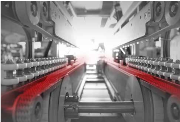
Image 4 The path for a cardboard packaging cycle. It is initially folded, then filled and finally sealed.