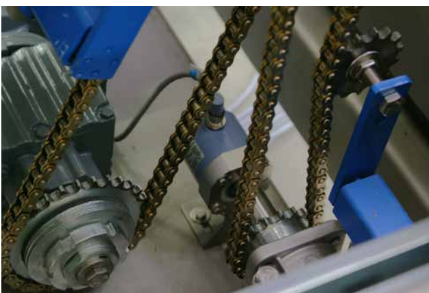
Image 6 Wachendorff encoders determine the exact position of the cardboard packaging. Their impulses provide information to the control on when the next process substep can be triggered.