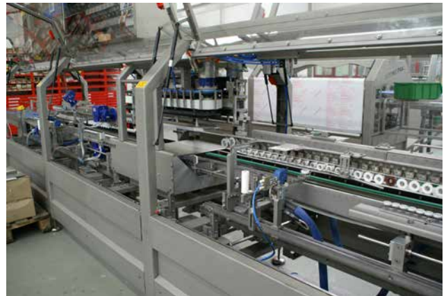
Image 7 The machine's aren't just developed in Flonheim but assembled there as well. This machine is almost ready for shipping.